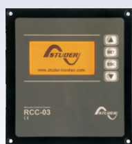
RCC -03 Remote control and programming center (Panel mounted)