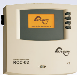
RCC -02 Remote control and programming center (Wall mounted)