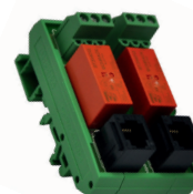
ARM-02 Auxiliary relay module