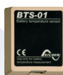
BTS -01 Battery temperature sensor